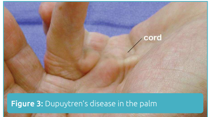
Figure 3: Dupuytren's disease in the palm

A physical exam and review of your medical history by a hand surgeon can help to determine the type of hand or wrist tumor you may have. X-rays might be taken to evaluate the bones, joints and possibly the soft tissue. Further studies such as ultrasound, CT, MRI or bone scans may be done to help narrow down the diagnosis. Needle biopsy or incisional biopsy (cutting out a small sample of the tumor) may be considered if the surgeon wants to