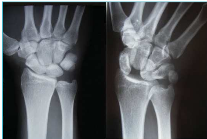
Figure 3: X-ray showing gap between scaphoid and lunate from ligament rupture (right) and normal x-ray of opposite wrist (left)

Your doctor will examine your wrist to see where it hurts and to check how it moves. X-rays are often taken. The purpose of the exam and X-rays is to make sure there are no broken bones, dislocated joints, or signs of a full ligament tear (Figure 3). In some cases, if a wrist sprain does not improve after a period of waiting, your doctor may order additional imaging to see if there are injuries that cannot be seen on X-ray or during a physical exam.